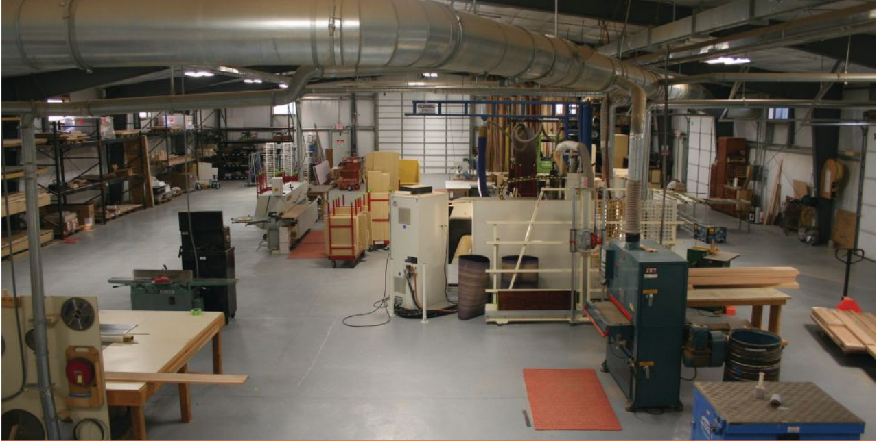
While the majority of work is high-end custom cabinetry, Vorst also manufactures entertainment centers, fireplace surrounds, mantles, bars, millwork and stand-alone furniture from its 17,000-square-foot production shop. The company also offers consultation and design services.

In addition to its expertise in the machining arena, the company excels in its finishing applications. Since moving into the current facility, Vorst has invested in technology that not only provides a high-quality finish for his products, but allows for flexibility in the operation.